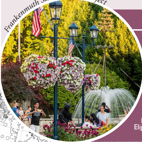
Frankenmuth Streetscaping Project