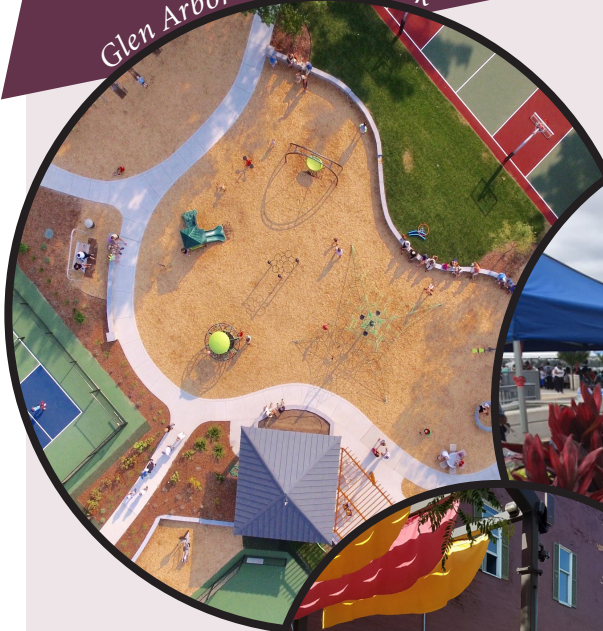
Glen Arbor Township Park