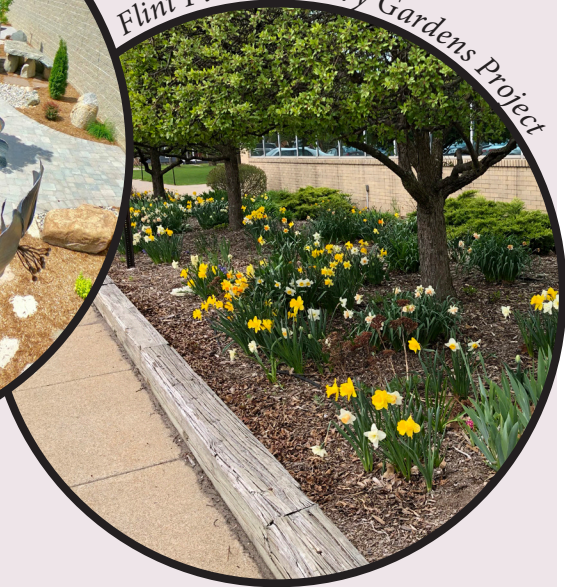
Flint Public Library Gardens Project