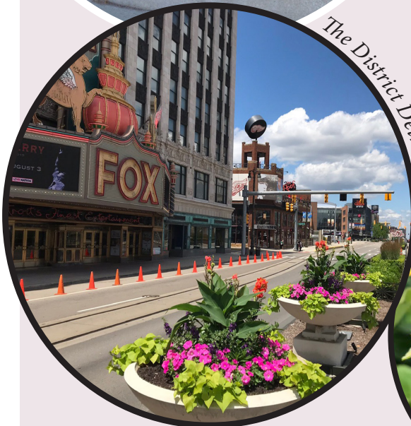
The District Detroit