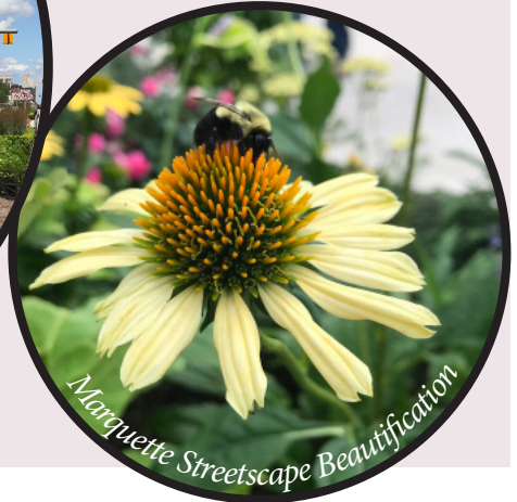
Marquette Streetscape Beautification