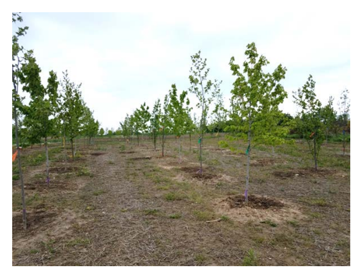
Photo 3. Field planting following installation in May 2018. All trees were mulched shortly after the photo was taken.

<u>Assessments</u> At the time of planting we recorded the length of time to install each tree, including the time for root modification and planting time. We also collected, dried, and weighed roots that were removed during the root modifications. We assessed survival, growth, leaf water potential, SPAD chlorophyll index, and photosynthetic gas exchange for two growing seasons (2018 and 2019) following transplanting. At the end of the second growing season (fall 2019), we destructively harvested a subset of half of the trees in Experiment 1 to determine above- and below-ground biomass. We did not harvest trees from Experiment 2 due to low replication and poor overall survival. For each tree harvested, we measured leaf, shoot, and trunk dry biomass. Root systems were harvested with a mechanical tree spade. We removed soil and residual container substrate from the roots using a pneumatic air-spade. We separated roots into those inside the original container root-ball and those outside the root-ball (Photo 4). Roots were further separated into fine roots (<5 mm) and coarse roots (>5 mm), dried, and weighed.