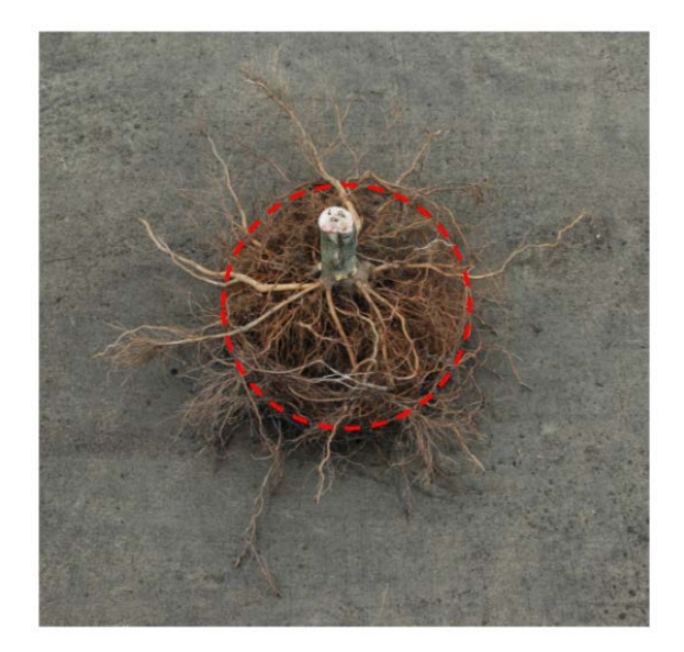
Photo 4. Example excavated root system of P. x acerifolia ; dashed line indicates perceived outline from the original nursery container.

<u>Assessments</u> At the time of planting we recorded the length of time to install each tree, including the time for root modification and planting time. We also collected, dried, and weighed roots that were removed during the root modifications. We assessed survival, growth, leaf water potential, SPAD chlorophyll index, and photosynthetic gas exchange for two growing seasons (2018 and 2019) following transplanting. At the end of the second growing season (fall 2019), we destructively harvested a subset of half of the trees in Experiment 1 to determine above- and below-ground biomass. We did not harvest trees from Experiment 2 due to low replication and poor overall survival. For each tree harvested, we measured leaf, shoot, and trunk dry biomass. Root systems were harvested with a mechanical tree spade. We removed soil and residual container substrate from the roots using a pneumatic air-spade. We separated roots into those inside the original container root-ball and those outside the root-ball (Photo 4). Roots were further separated into fine roots (<5 mm) and coarse roots (>5 mm), dried, and weighed.