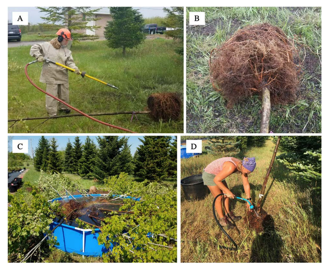
Photo 2. Examples of root-ball treatments. A – Bare-root airspade treatment. B – Root-ball following removal of container substrate. C – Soaking root-balls for bare-root wash treatment. D – Bare-root wash treatment.

The trees were transplanted to a field block at the MSU HTRC and were planted in six rows, 2.7 m on center. For all treatments, the planting holes were backfilled with unamended backfill, and the trees were watered immediately after planting. We mulched all trees with a ring (1.5 m diameter) of ground blonde pine wood mulch to a depth of 8 cm (Photo 3).