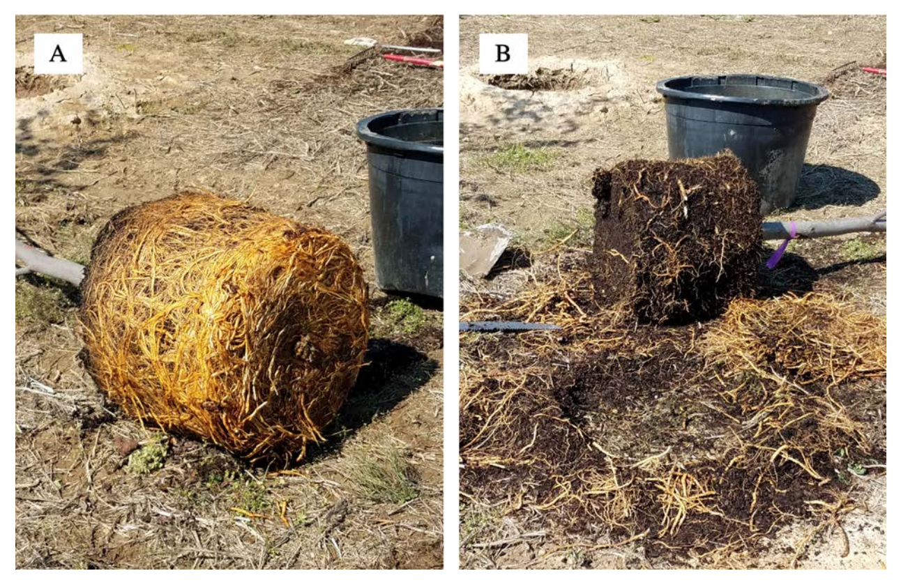
Photo 1. Examples of root-ball treatments. A – Control treatment. B – Shave treatment.

Experiment 1: Spring planting. In May 2018, 32 container-grown trees of October Glory® red maple ( Acer rubrum 'October Glory'), columnar tulip poplar ( Liriodendron tulipifera 'Fastigiatum'), and Bloodgood London planetree ( Platanus x acerifolia 'Bloodgood') (96 total) were transplanted to a field plot at the MSU HTRC. The experiment was installed as a 3 x 4 factorial of species (3) and root modification treatments (4) with eight replications (N=8). Trees of each species were randomly assigned one of four root-ball modification treatments. The root-ball modification treatments included: 1) Control – nursery container removed and planted without root modification (Photo 1A); 2) Shave – removal of the 3 cm periphery and bottom of the root-ball using a pruning saw (Photo 1B); 3) Bare-root airspade – removal of all container substrate using compressed air flow from a pneumatic air spade (Photos 2A and 2B), then any obvious root deformations, such as kinked or girdling roots, were removed with hand pruners; 4) Bare-root wash – root-balls were soaked in water approximately 12 hours prior to additional handling (Photo 2C), then, the following day, all container substrate was removed using a stream of water from a garden hose (Photo 2D) before removing any obvious root deformations using hand pruners.